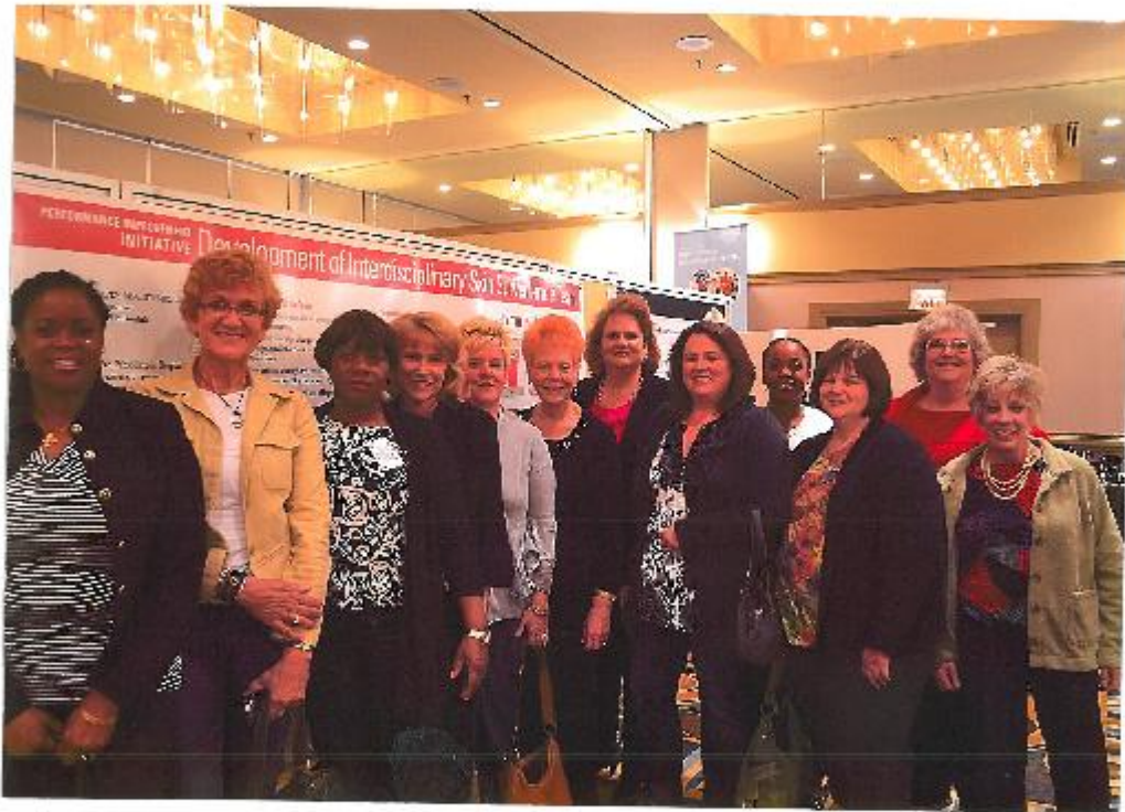
ARN Region 3 Wakemed acute rehab and skilled facility staff and below Poster presentation by Wakemed